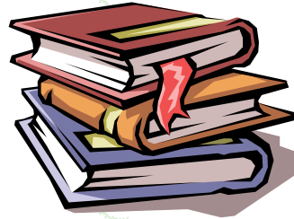
A copy of the Village Municipal Code book is at the Ella Johnson Library

CURFEW: Anyone who is less than 17 years of age must not be on public streets after 11 p.m., Sunday through Thursday, and 12 midnight, Friday and Saturday unless accompanied by a parent or guardian.